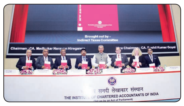
Release of publication BGM on UAE VAT at CA Day Celebration