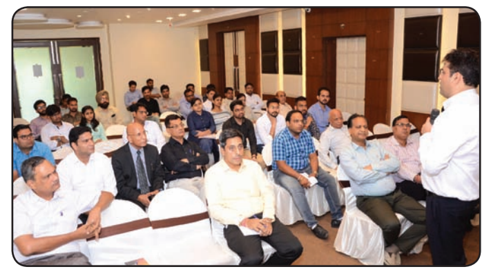
Workshop on GST at Sriganganagar